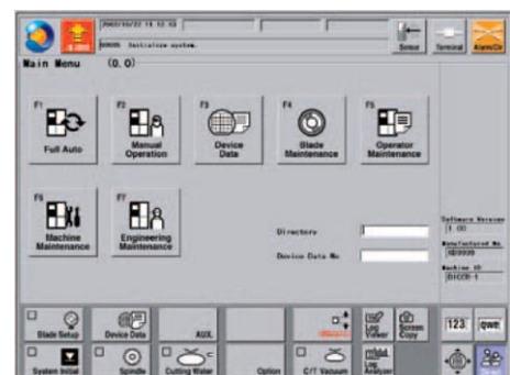
LCD touch screen